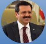
M. Rifat HİSARCIKLIOĞLU TOBB President