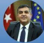
Faruk KAYMAKCI Deputy Minister of Foreign Affairs & Director for EU Affairs, Ambassador