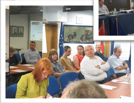
Athens, Greece W13