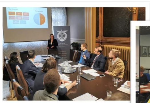
Riga, Latvia W23