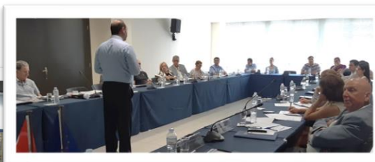
Sofia, Bulgaria W16